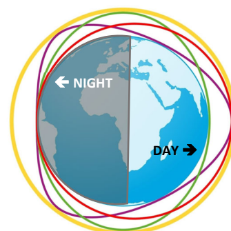
— Fundamental mode (7.83Hz) — Second order (14.1Hz) — Third order (20.3Hz) — Ionosphere

The purpose of the SafeZon™ , invented by Dr. George Roth, is to provide a normalizing electromagnetic field (EMF) that mimics the Earth's own background frequencies, sometimes referred to as Schumann frequencies or resonances . The Schumann resonances (SR) are a set of peaks in the extremely low frequency (ELF) portion of the Earth's electromagnetic field spectrum. They are generated and excited by lightning discharges in the cavity formed by the Earth's surface and the ionosphere. The SafeZon™ is designed to provide a similar range of frequencies, resulting in a biocompatible electromagnetic field , which appears to counteract or mitigate the combined effects of the decline in the Earth's naturally occurring field and the influence of EM pollution. The device is programmed to provide a range of frequencies consistent with the naturally occurring day/night variations generated by the Earth. These biocompatible fields are similar to specific brain wave levels and thus support optimal neurological and biological physiology, providing relief from many of the symptoms associated with EHS.